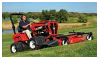
Side-Discharge Rotary Mower