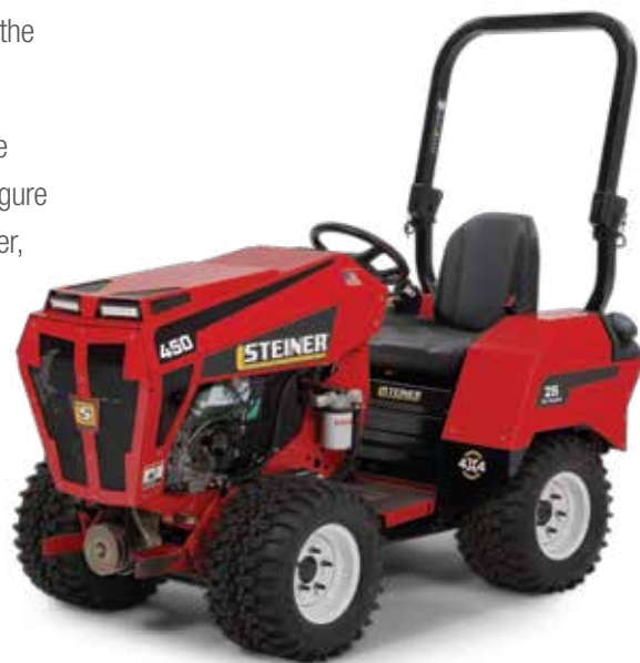
450DX prototype shown in photos. Production unit decals will differ.